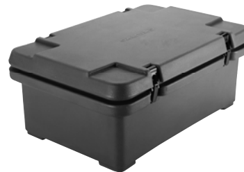
For Camcarrier (160MPC)