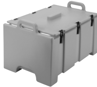
For Camcarrier (100MPC)